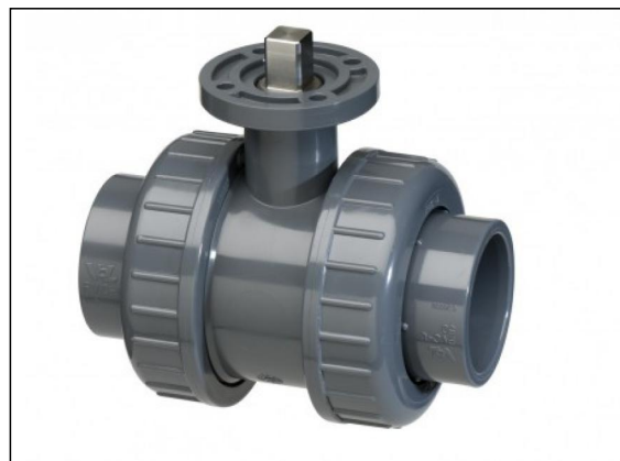
3.60 Raccord union type A